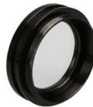
Oil proof mirror